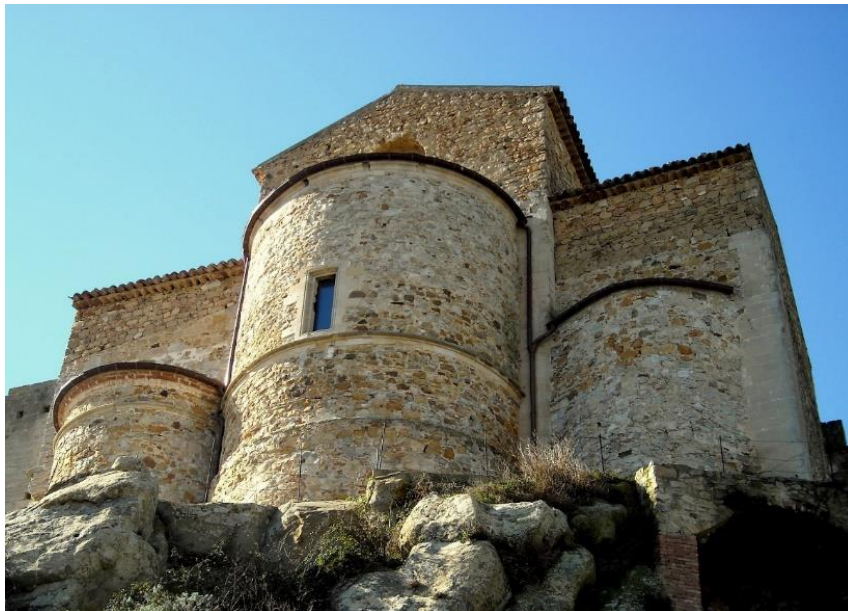
Apses of the church of san Michele arcangelo