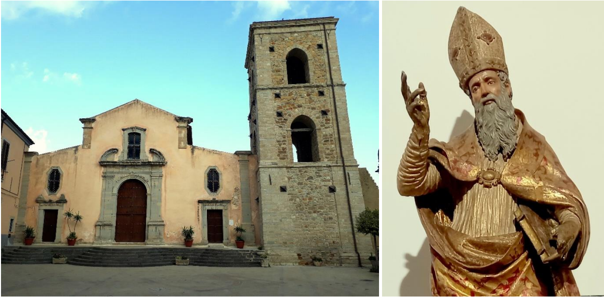
Church of san Michele arcangelo and wooden statue of san Luca Casale

reconfirmed by Roger II. In 1388 it became the first parish of Nicosia and its parish priest was part of the chapter of the Collegiate Church of Santa Maria Maggiore.