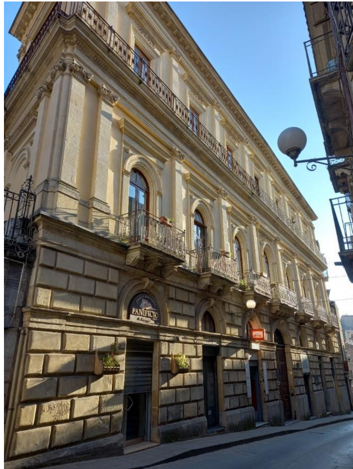
Palazzo Cirino

Moving on, the monumentality of the Palazzo Cirino , built between the 17th-19th centuries, of an ancient Spanish family that came to Sicily in the 13th century and settled in Nicosia in the 18th century, is striking.