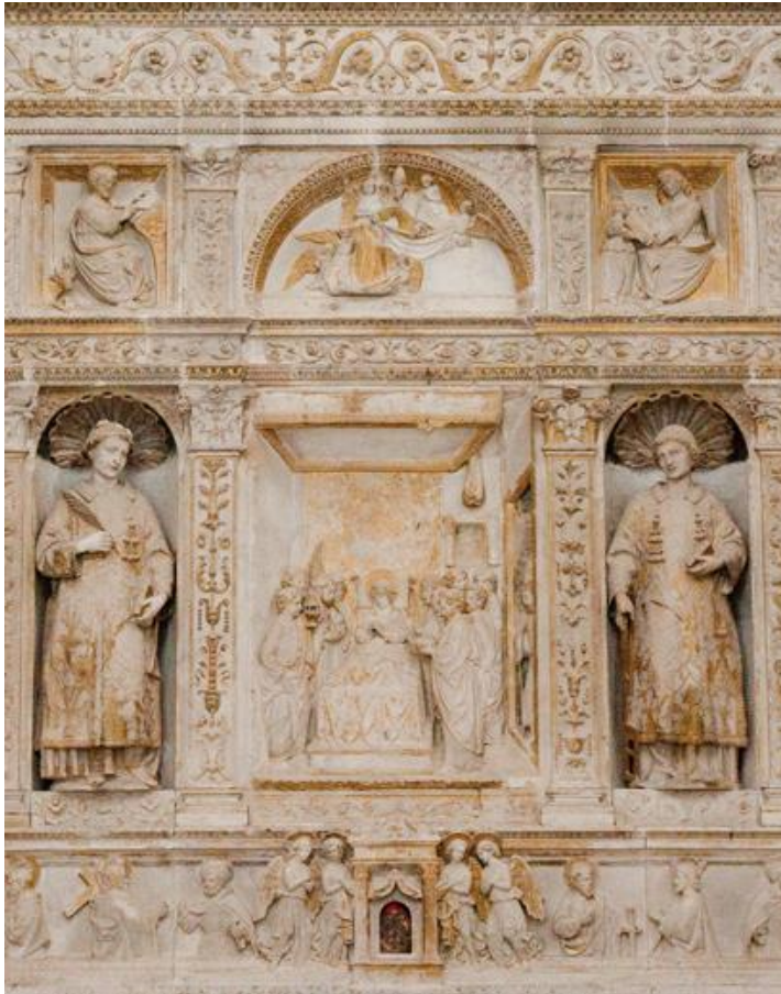
Detail "Cona" by Antonello Gagini