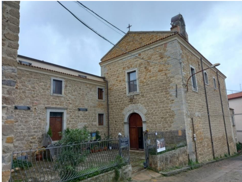
Church of santa Maria degli Angeli