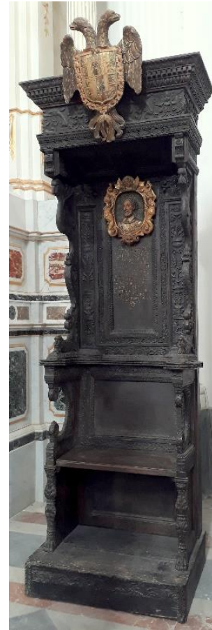
"Chair of Charles V"