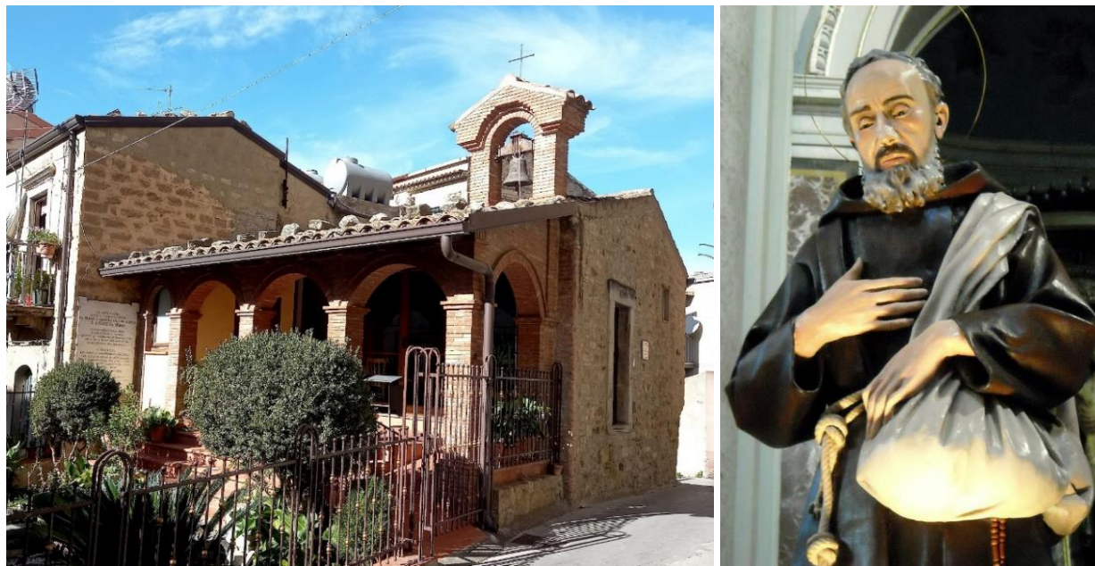
Birthplace and wooden statue of san Felice da Nicosia