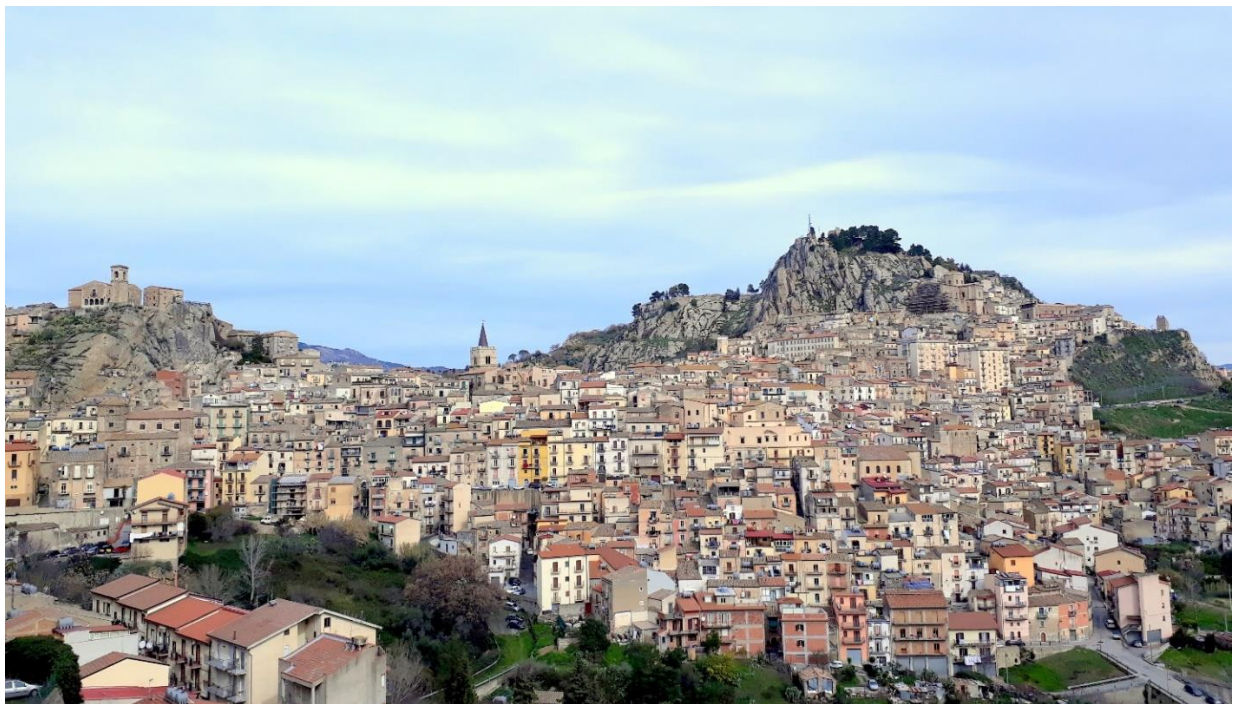
Overview of the city of Nicosia

Historical-cultural-sport itinerary through the neighborhoods (rrughè), alleys (vaneddè), and underpasses (baddadörè) of the city of Nicosia.