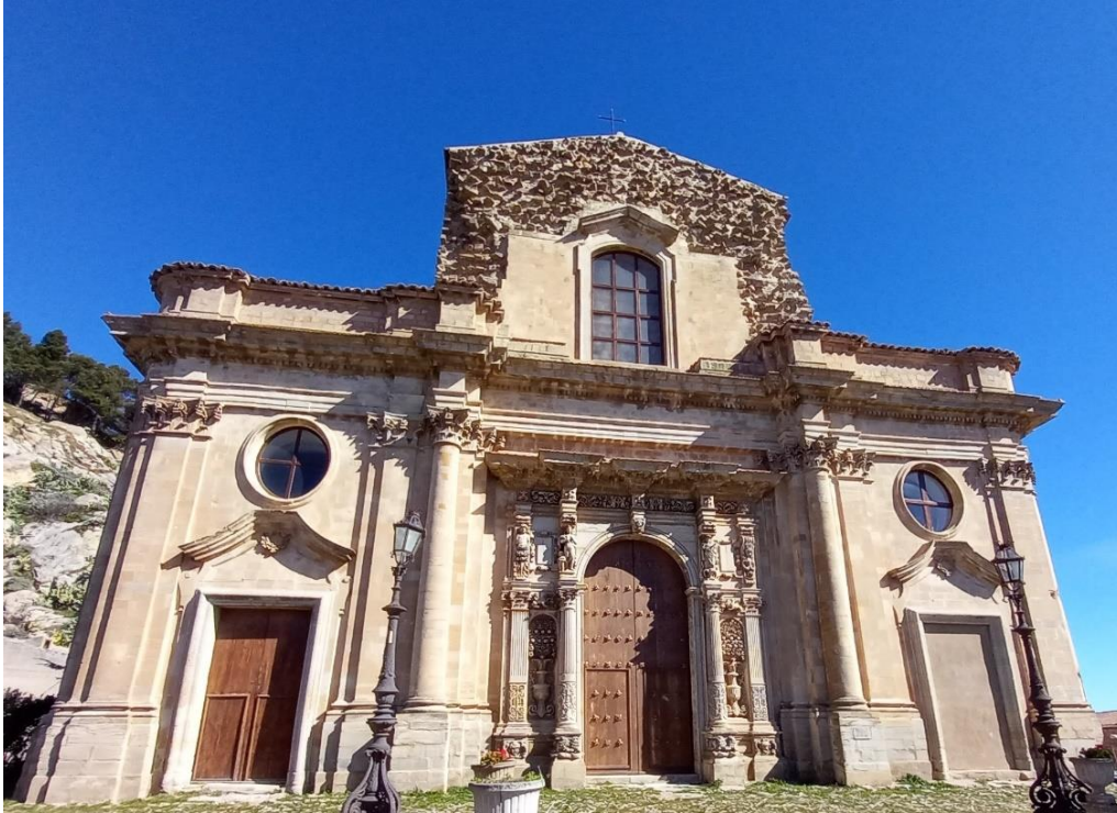
Basilica of santa Maria Maggiore

It collapsed, along with part of the neighborhood, in 1757, due to a 14-month subsidence. During this time much of the artwork that we can now admire inside the new church was recovered. Work began in 1767, designed by Catanian Carmelo Battaglia, and continued slowly to the point that it was not until 1904 that the new basilica was inaugurated.