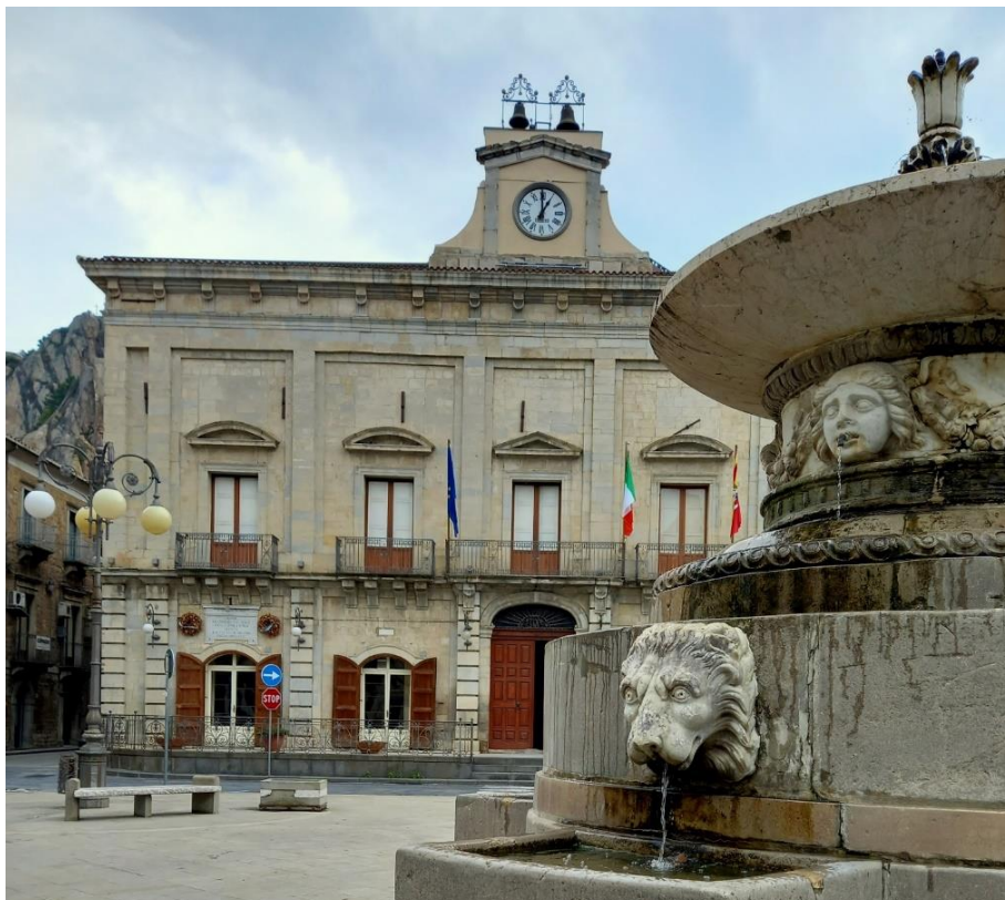
Palazzo di Città and the artistic fountain

Visit n° 2 Starting from this building, we will begin to cross the characteristic baddadörë (underpasses) and, by walking through the historic vaneddë (alleys) of the ancient urban context, we will reach the magnificent Garibaldi Square, the heart of the city, once known as "piano di san Nicola", where the wonderful Palace of the City and the Cathedral Basilica with its superb bell tower and several palaces of the nobility capture attention. The center of the square is made scenic by a magnificent 19th century fountain.