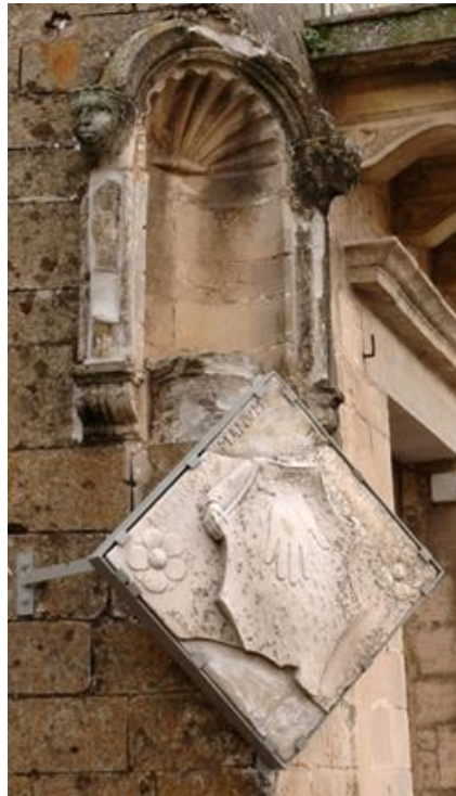
The ancient border of the “Piliere”

Between XII-XIII Nicosia was repopulated by lombard settlements from Northern Italy. Their permanence signed the local dialect. Over the years, the coexistence between the lombards and the natives wasn't simple. As a result of their conflicts, the city was divided in two parts: the upper part belonged to the marians ( santamariotè ) the inhabitants of santa Maria Maggiore, while the lower part of the city was managed by the natives ( santanicölarè ), inhabitants of St.Nicholas district. The edge that marked the two districts was known as piliere ( pelierö ), even nowadays located in street Francesco Salomone .