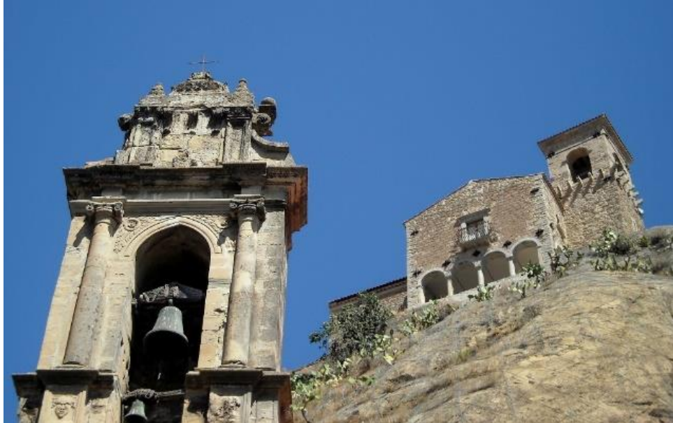
Church of the SS. Salvatore anchored on the cliff, photo by Santino Barbera

Continuing is Palazzo Speciale of Mallia , which belonged to another ancient Speciale family and was remodeled in the 19th century. Inside it holds valuable frescoes. Arriving in the rise, we encounter the Pontorno Palace , which belonged to an ancient Nicosian noble family. The 18th-century palace was modified in the mid-20th century.