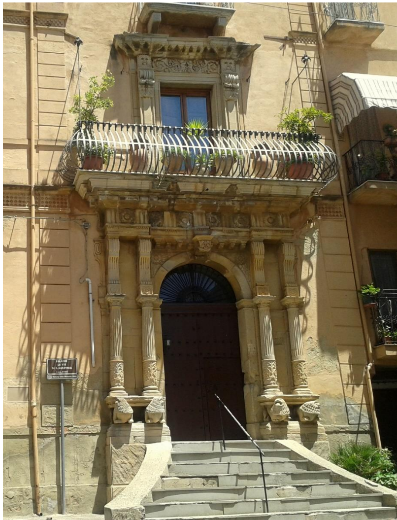
Palazzo La Via di sant'Agrippina

was born and spent his childhood in this district, wore the monk's habit at the abbey of Santa Maria Latina in Agira (EN) and later became its abbot; his body rests in an urn in Agira (EN).