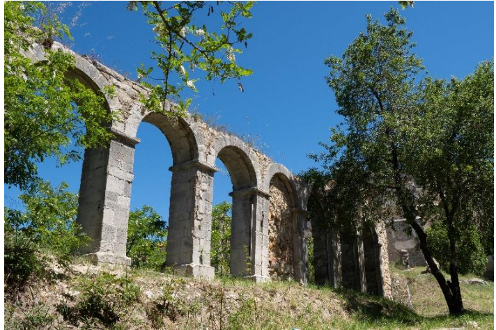
Church of san Giuseppe and ruins of the former monastery of santa Domenica

Adjacent to the church stood the former monastery and church of St. Sunday, of the Benedictine order. It was built about the 15th century. The church was adorned with a beautiful Baroque facade and tiled floor; it held many works of art. With the laws of 1866 it was suppressed and the former convent became a school. During the 1967 earthquake, the church and the old convent, formerly a school, suffered several damages. During reconstruction in the 1970s, the church's fine Baroque facade was dismantled. Since then, only a few architectural emergencies remain of this ancient complex, including the characteristic arches of the ancient cloister.