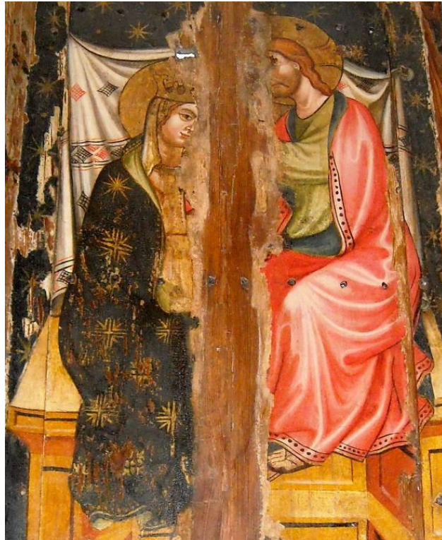
Detail of the wooden ceiling, "Coronation of the Virgin" (mid-15th century), at the Diocesan Museum of Sacred Art in the former monastery of san Biagio in Nicosia (EN).

and in the transept, while scenes from the New Testament were painted in the side naves and minor prophets on the walls of the Dome. The exterior maintains the 15th century main portal, finely crafted in the Chiaramonte style, and the monumental bell tower, which was erected over the centuries (11th-17th centuries). The portico was built between 1489/1490, while the finely carved ancient arches of 1656 were placed outside in the 19th century (originally they were inside the church).